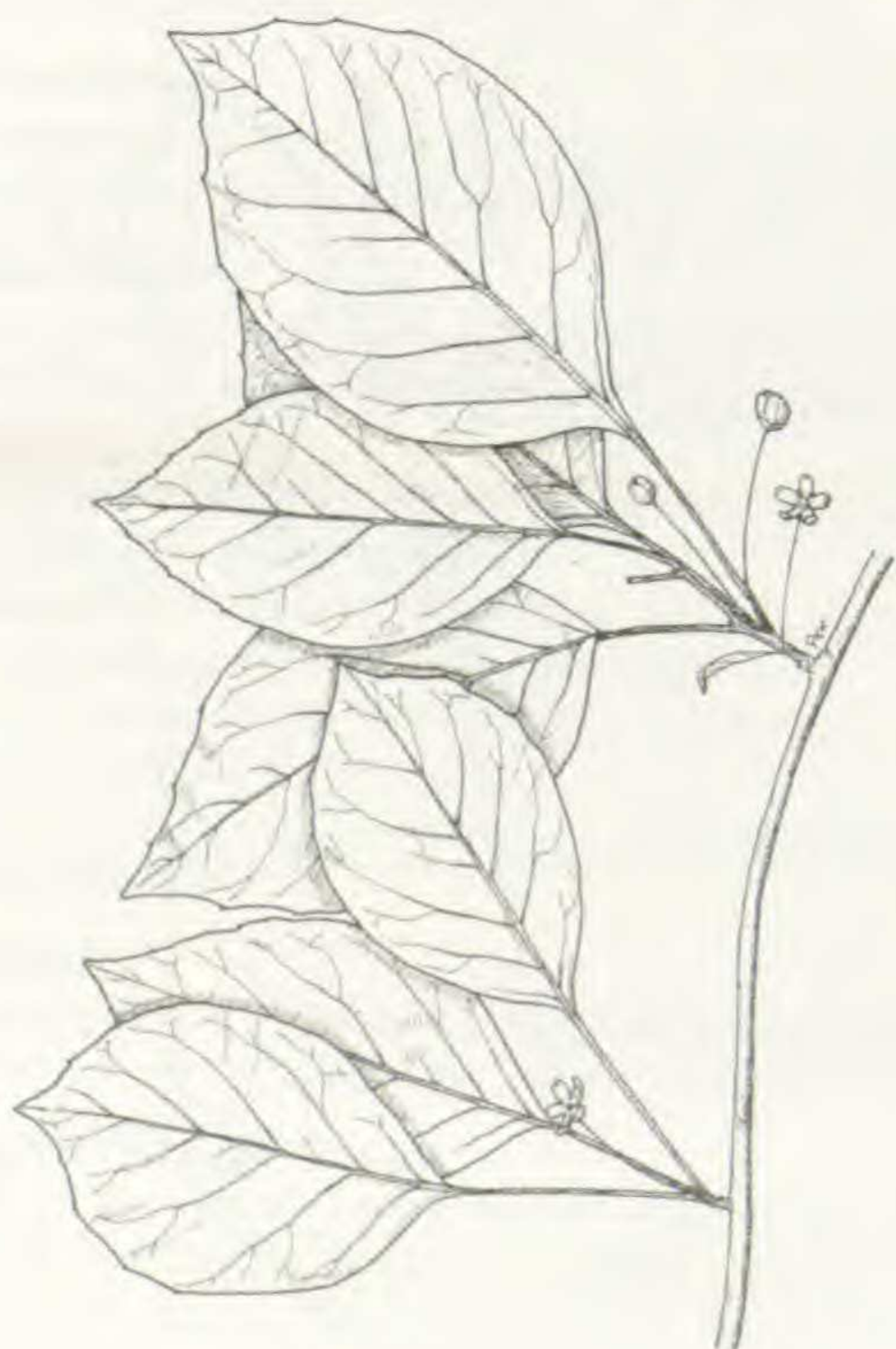
FIG. 8. Schisandra glabra .